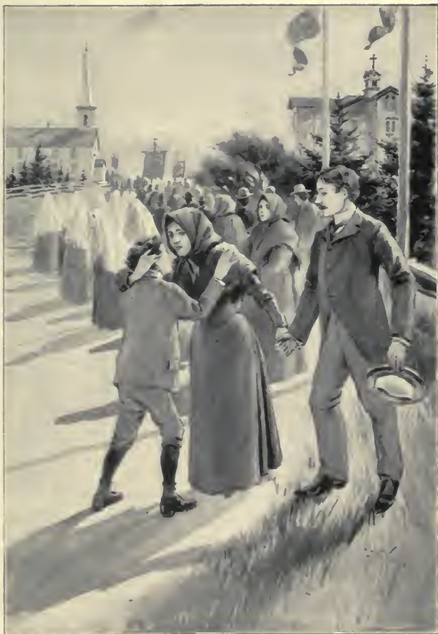
"THROWING HER ARM AROUND THE NECK OF HER RECOVERED CHILD."